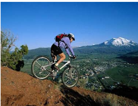
Carbondale Parks and Recreation